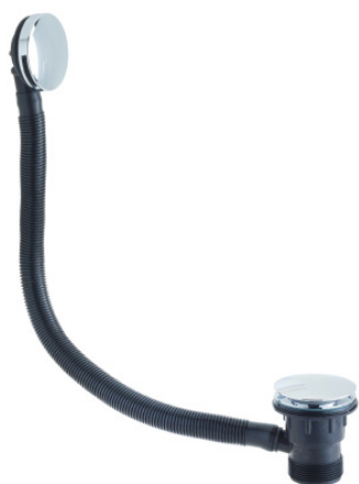
Chrome Version Pictured