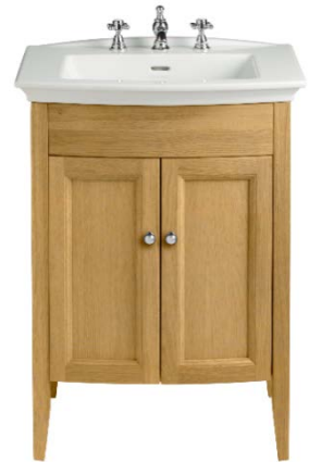
Shown with Blenheim Basin (supplied separately)