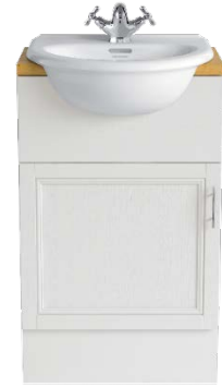
White Ash finish pictured, basin sold separately