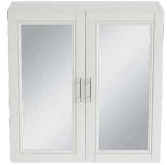
White Ash finish pictured