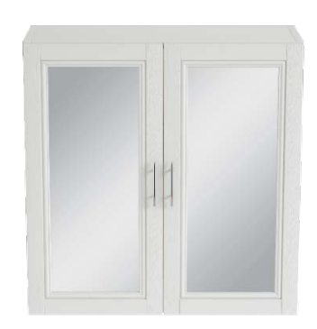
White Ash finish pictured

Dimensions for Fitting: 660 (H) mm, 640 (W) mm, 200 (D) mm