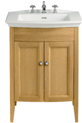
Shown with Blenheim Basin (supplied separately)