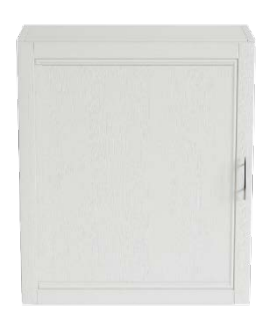
White Ash finish pictured