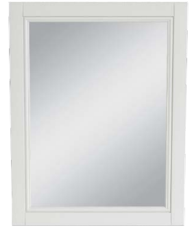
White Ash finish pictured