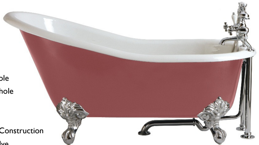
BRT27 with Imperial Feet pictured