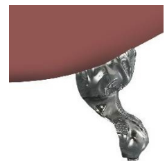
BRT33 Imperial Feet