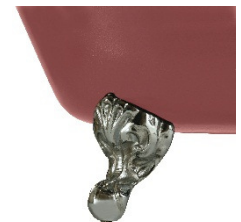
BRT13 Heritage Feet