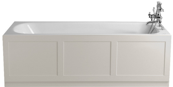
BRT60 with White Ash Bath Panel pictured