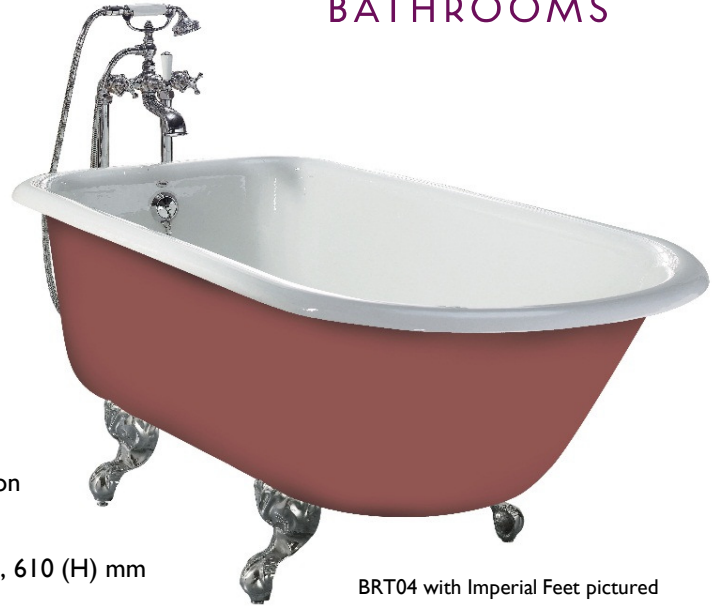
BRT04 with Imperial Feet pictured