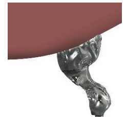
BRT24 Imperial Feet

Technical Advice: For further information please call 0844 701 8503 or email technical@heritagebathrooms.com .